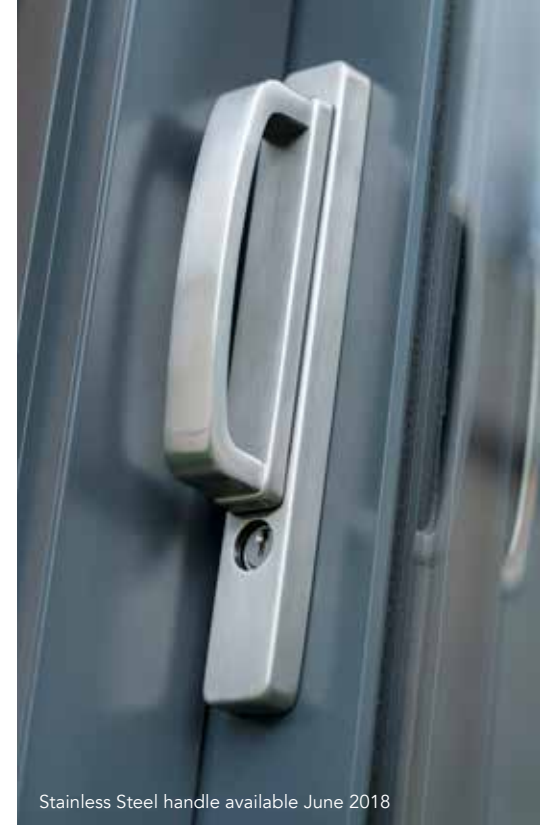
Stainless Steel handle available June 2018

For added peace of mind choose the optional laminate glass upgrade – giving your WarmCore patio doors 'Secured by Design' accreditation - the official UK Police initiative 'designing out crime' through physical security.